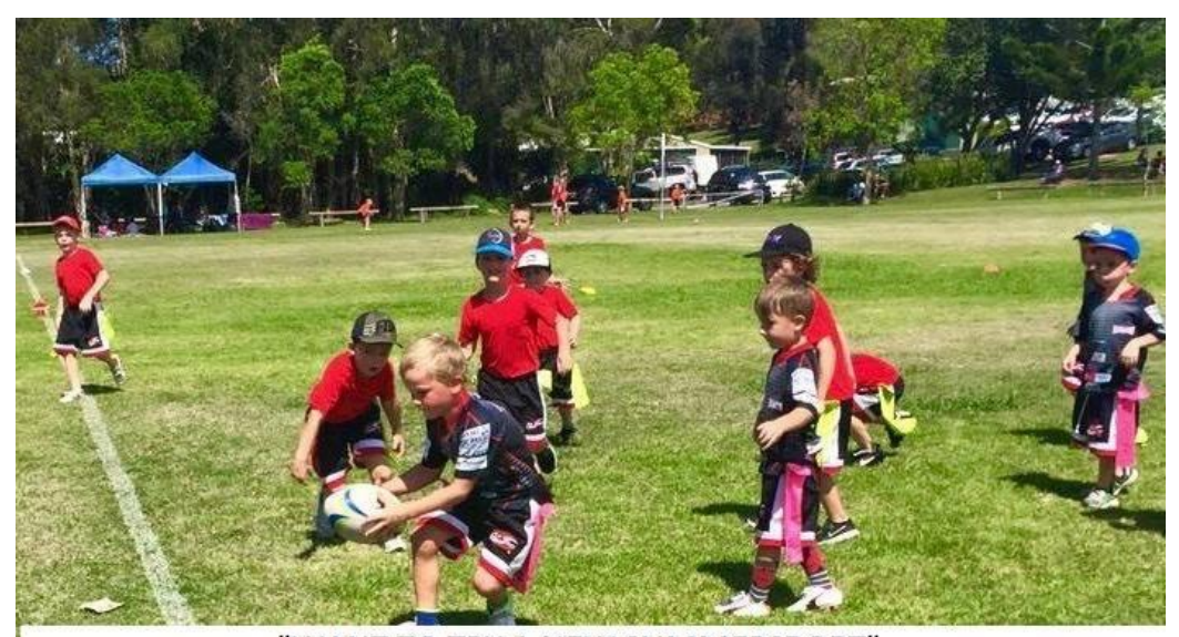
"WANT TO TRY A NEW SUMMERSPORT" "CALLED TAGFOOTBALL" ALL AGES WELCOME: YRS 0 - 8 BROMLEY PARK (pages rd)

START DATES - 26TH OCT- 22 FEB DEBS NEYLON 0272233395 NIME SHERLOCK 0212975624