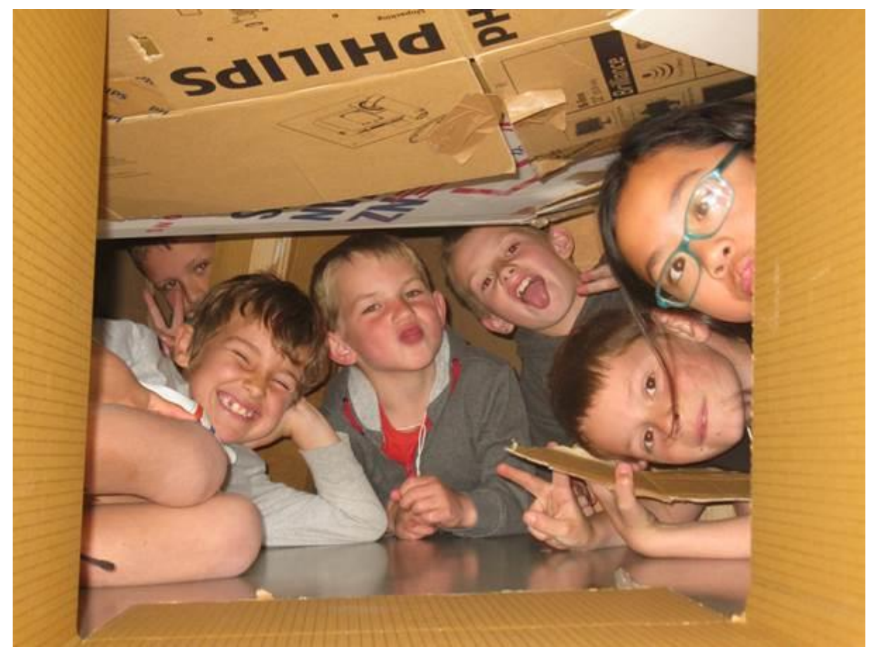
(A snap shot of the great fun we had last school holidays – Air Raid Shelter)