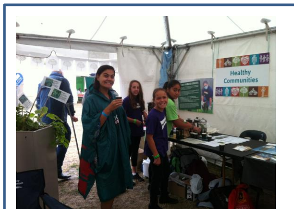
Tamariki serving tea at Matatini.