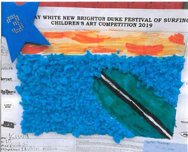
Kiwa—3rd place (9-10 yr olds)

"Your piece makes me feel like I'm at the beach. Great use of sand and paper to add textural elements. I loved the surfboard designs. Amazing."