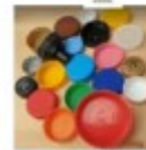
Please no plastic cups larger than 1 litre