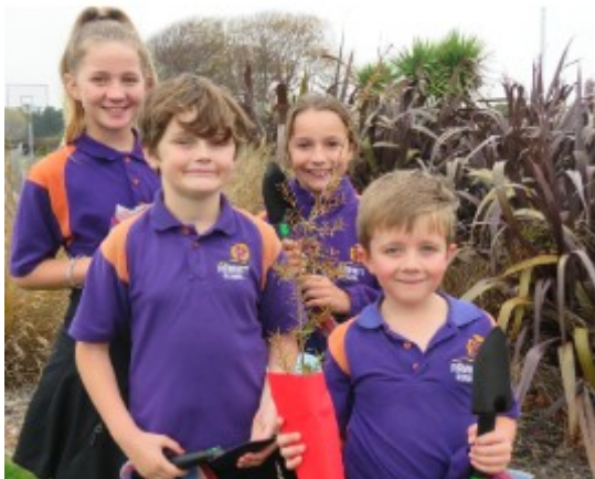
Our tree planters: Charli, Charlie, Charli and Charlie

On the actual Coronation Day, Mayor Phil Mauer joined other Mayors around the country, along with the Deputy Prime Minister and other politicians, in planting a tree to commemorate the coronation. Earlier this week, the Governor-General planted the final coronation tree at Government House in Wellington. The Visits and Ceremonial Office of the Department of Internal Affairs is keen to get all the GPS details from all tree plantings nationwide in order to create a webpage so that members of the public can find the Kings trees for years to come.